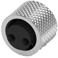
M8, 2P Female