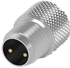
M8, 2P Male