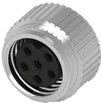
M8, 6P Female