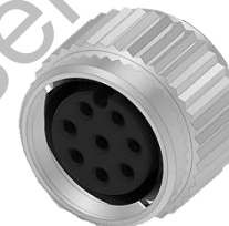
M8, 8P Female