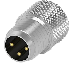
M8, 3P Male