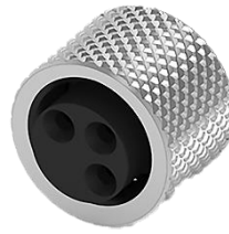
M8, 3P Female