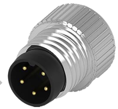
M8, 5P Male