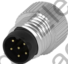
M8, 6P Male