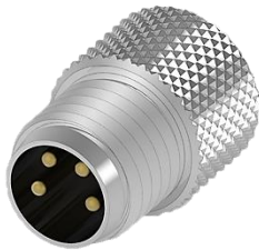
M8, 4P Male