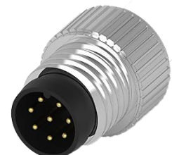
M8, 8P Male