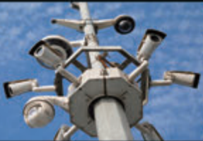
Remote adjustment of inaccessible equipment and out-of-reach positions