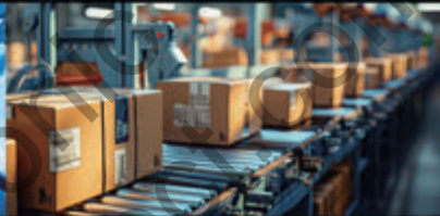
Ideal for changing the focus position and WD settings for objects of various heights.