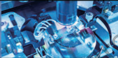
Precise modifications that do not require manual adjustment.