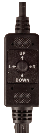
External OSD Controls For Ease of installation