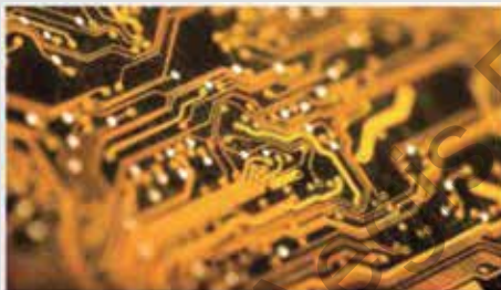
Make precise adjustments to lenses after installation