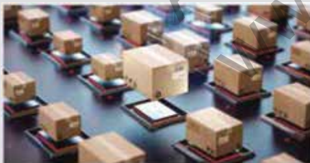
Changing the focus point and changeover for workpieces at different heights