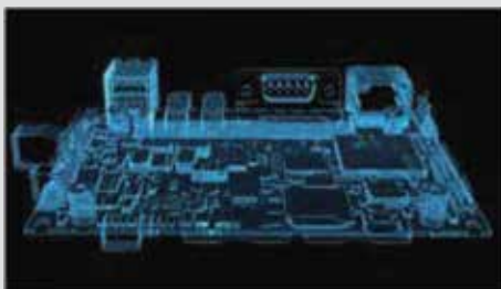
Perfect for embedded systems