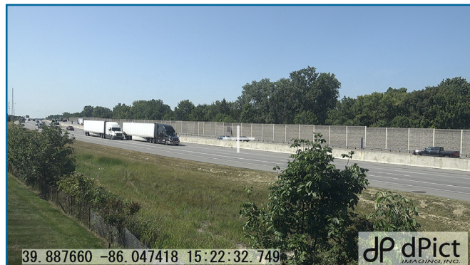
DP-800S Real-Time Overlay (Option)