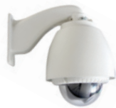
Outdoor Wall Mount A-ODW5CS Item #1381V096