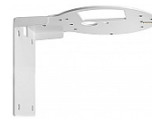
Wall Mount A-SWD5WB3 Item #2787V308

1-800-OK-CANON | NETWORKCAMERAS.USA.CANON.COM