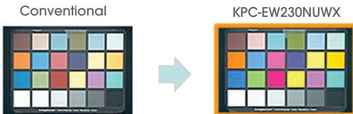
Color Chart Under Halogen Lamp

KPC-EW230NUWX is equipped with more excellent color reproduction from wide range of ATW. (1,800K to 10,500K)