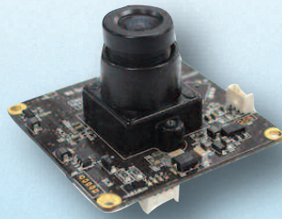
Fixed Lens CMB

ELECTRONIC GROUP, INC 480-635-8400 p * aegis-g2@aegiselect.com http://www.aegis-elec.com