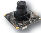
Fixed Lens CMB