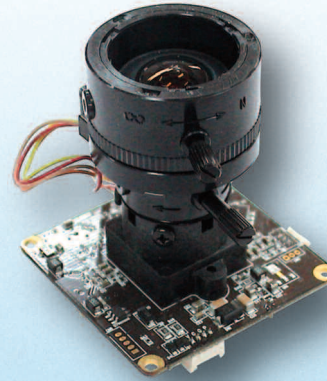
Varifocal Lens CMB/DMB