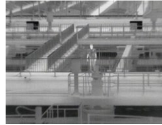
Optical zoom 70mm (2x)