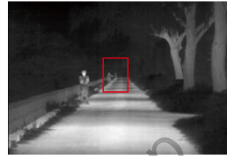
Optical zoom (3x)