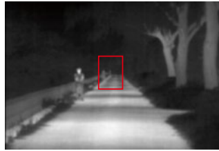
Digital zoom (3x)