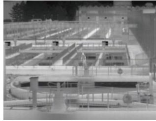
Optical zoom 35mm

Maintaining the highest quality image while changing magnification is critical for acquiring accurate pixel data and reducing false alarms, and this is the key difference compared to digital zoom.