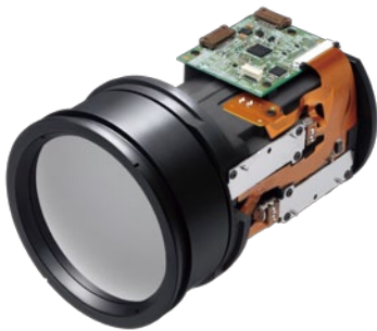
Photo shows Model LVZ3X3516N