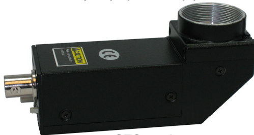
STC-400L Available with or without I/R Filter Images shown not actual size

The STC-400 Series is a collection of products to fit a wide variety of applications. The STC-400 Series comes in 1/3" and 1/2" CCD formats and in compact, remote head, and "L" shaped camera housings. With selectable shutter speeds from 1/60 to 1/10,000 of a second, the STC-400 Series cameras can capture scenes and virtually any speed crisply and clearly