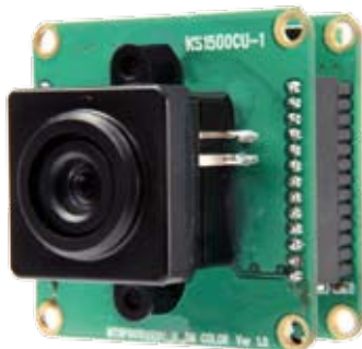
iCube customized solution with AUTOFOCUS lens

The iCube series is also available without housing as small sized and lightweight board level cameras for OEM use. All advantages of the standard iCube camera with housing plus additional customer requirements can be implemented in a board camera at a competitive price level. Specific board level features for customized OEM solutions on request.