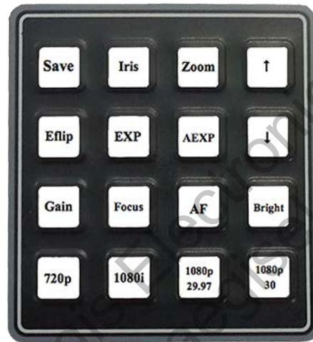
AEG-Controller-EV1 (For FCBEV Cameras)