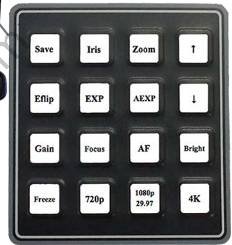
AEG-Controller-ER1 (For FCBER8300 Cameras)

Sleek, Portable, Handheld controllers ideal for the SONY FCB series of block cameras. Flexible, configurable controllers designed to work with all Sony FCB cameras. These controllers can be programmed to control a majority of SONY FCB camera functions. Custom program configurations are available. A sales representative can assist in determining the best configuration to meet individual needs.