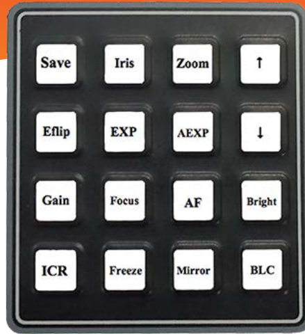
AEG-Controller-EX1 (For FCBEK Cameras)