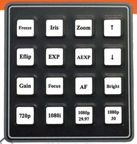
AEG-Controller-EH1 (For FCBEH Cameras)